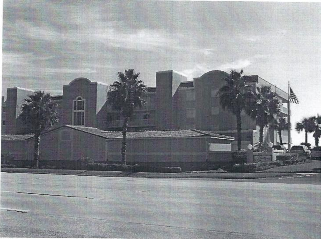
FRONT VIEW DATED 09/07/2012