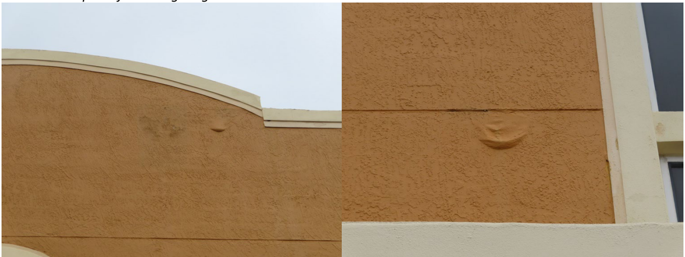
While much less of a concern, several areas were noted on Bldg 3 where paint is bubbling.