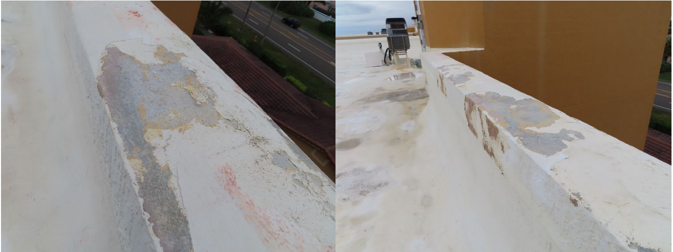
Damage to parapet wall on Bldg 1. Note that this is from the recent replacement of the tiles roof section.

1. Waterproofing repairs – We noted wear/tear to the exterior painting and waterproofing, which is expected due to the age of the waterproofing and oceanfront location; however, we found that building 1 had significantly more wear. We noted missing painting/stucco on the parapet wall above where the tile roof section was replaced along with bubbling of paint on all elevations. With a full waterproofing project not projected for a year or two and we recommend addressing these areas/issues until a full waterproofing and painting project can be completed.