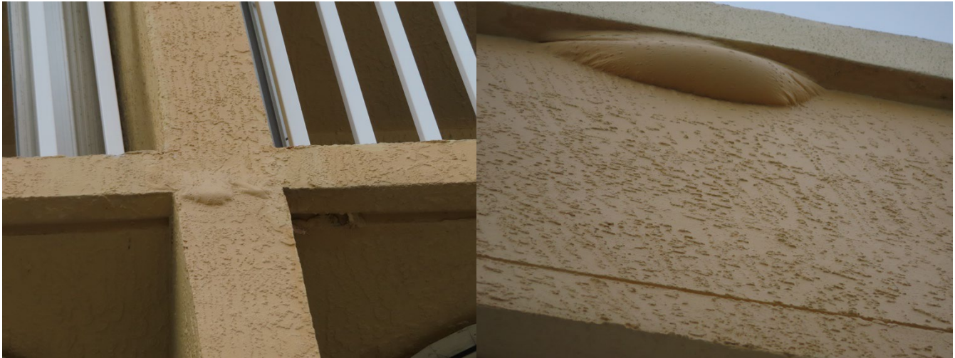
Further examples of bubbling Bldg 1.