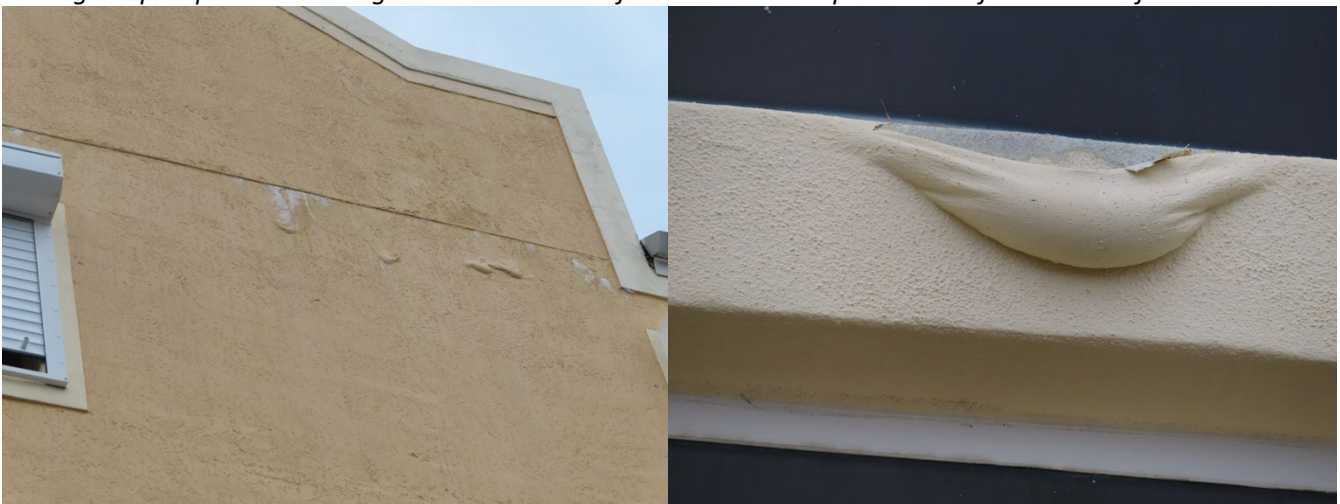
Paint was found to be bubbling throughout the exterior of Bldg 1.